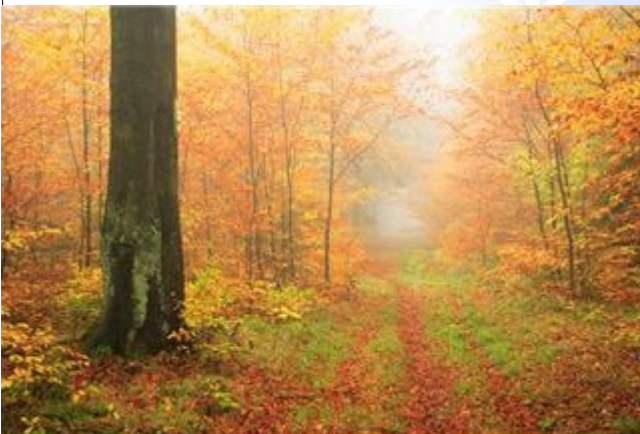
A snowmobile trail awaits brushing and clearing.

This trail and the trail to the Township Tavern are currently local trails. It is hoped that they will soon be funded for maintenance and grooming under the NYSSA/OPRHP snowmobile registration grant.